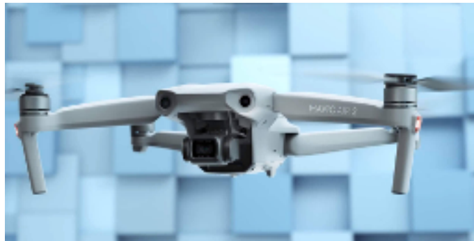
DJI Mavic Air 2

You can try this at home, just try not to break your drone in the process. Good Luck!