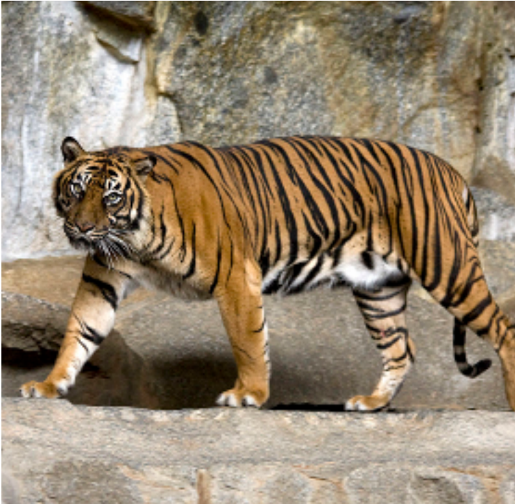
Tiger (Not Nadia)