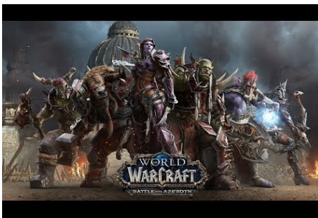
The Horde in World Of Warcraft: Battle For Azeroth

Researchers can study the way people behave because of a code bug