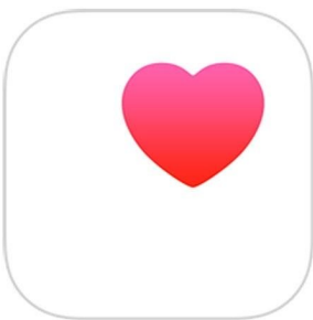
Apple Health App Icon

Apple has many life saving features: here are some.